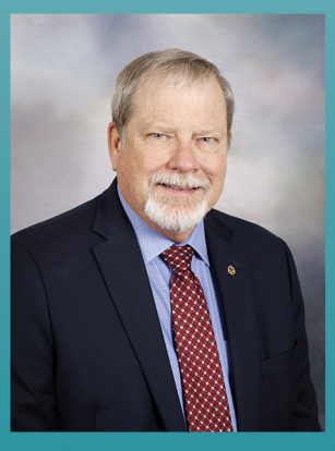
Judge Bobby Arther