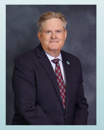
Mayor of Hobbs Sam D. Cobb